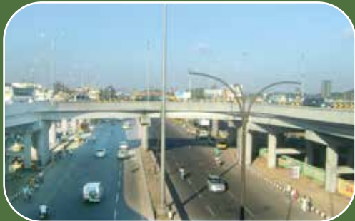
Grand South Trunk Road

Demand on this stretch is being driven by the two SEZs. Guduvanchery falls between the Mahindra World City and MPEPZ, both located 13 – 15 km away. “The maximum demand exists for Land investments in near Guduvanchery – Thiruporur road stretch which are available for a price range of Rs 350 – 2000 per sqft,” who have gated community housing plots of various category. Only about 30-40 per cent demand comes from the end users. “This stretch has seen an average appreciation of nearly 40 per cent in capital values of projects in the last 2 years thus promising good return on investments. There is also demand for rented units from the professionals working in the SEZs.